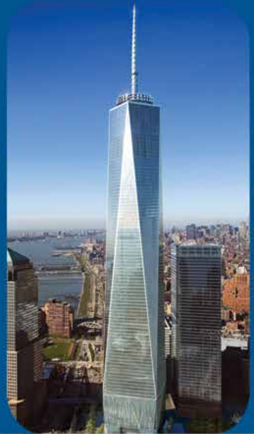
World Trade Center, New York City

From the top of the new World Trade Center to the U.S. Capitol dome, from the scorching heat of Puerto Rico to the ice and freezing temperatures of Alaska, when there is a critical waterproofing and surfacing challenge, the Kemper team delivers the solution.