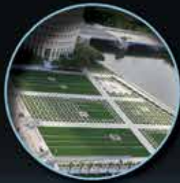
Plazas and IRMA Roofing