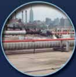
Interior and Industrial Applications