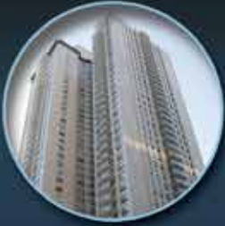
Balconies and Terraces