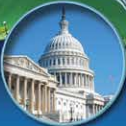
Gutterways and Flashings