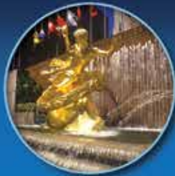
Fountains and Water Features