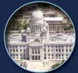
Existing Roof Recovery