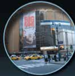
New Roof Assemblies