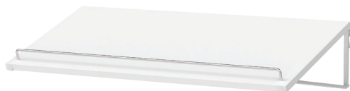
30" SHOE SHELF KIT (30") 29.75"W X 14"D SHOE SHELF (5/8")