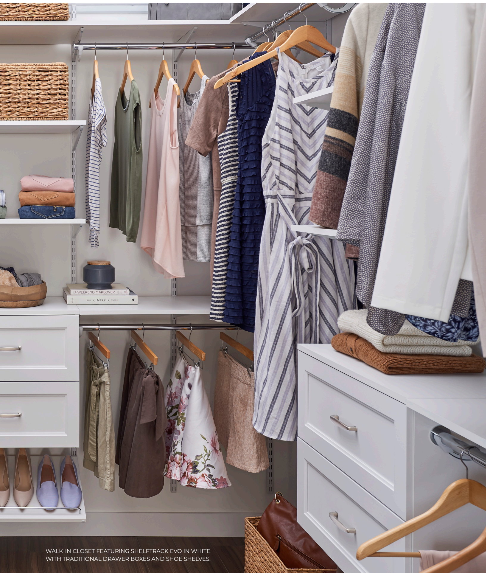
WALK-IN CLOSET FEATURING SHELFTRACK EVO IN WHITE WITH TRADITIONAL DRAWER BOXES AND SHOE SHELVES.