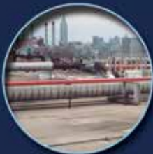
Interior and Industrial Applications