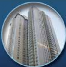
Balconies and Terraces