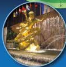
Fountains and Water Features