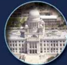
Existing Roof Recovery