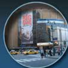
New Roof Assemblies