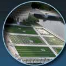
Plazas and IRMA Roofing