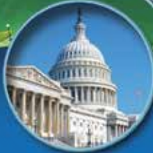
Gutterways and Flashings