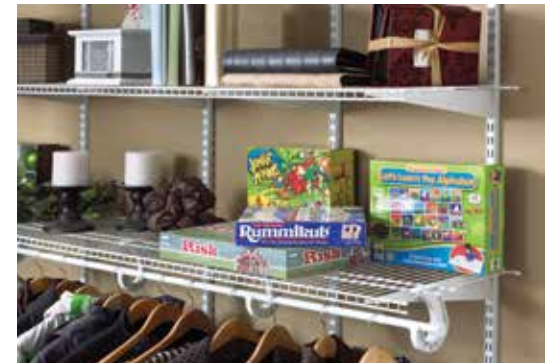
SuperSlide® — ShelfTrack®