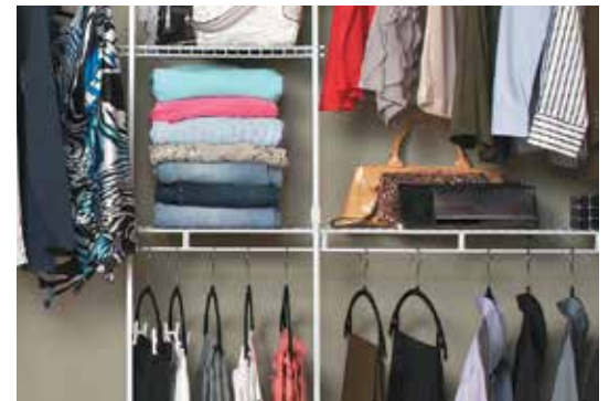
Shelf & Rod