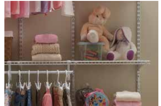
SuperSlide® — ShelfTrack™