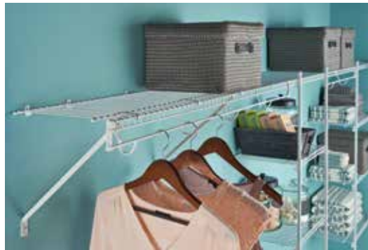
TotalSlide® Pro — Fixed Mount